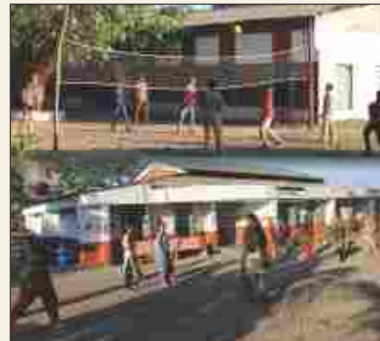
2013, De-addiction Center