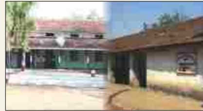
1956, Dispensary - Chaswad