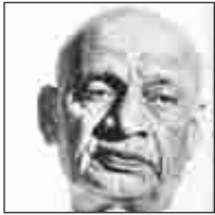
Sardar Vallabhbhai Patel